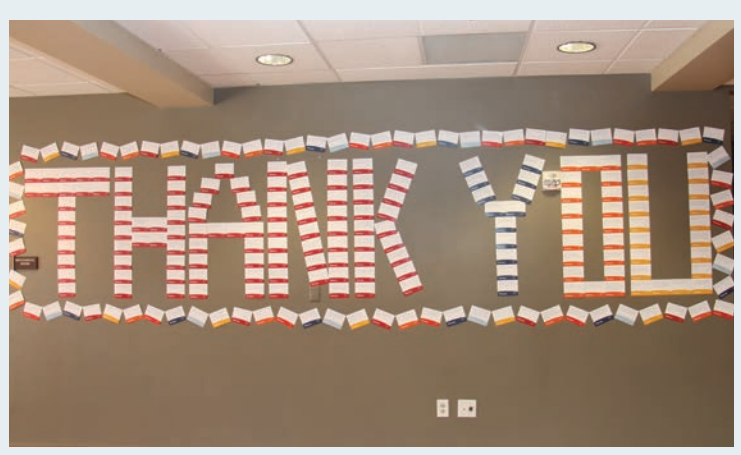
Notes from the community supporting our health care workers.

Assistance included helping one employee, whose partner was laid off from a job in the restaurant industry, cover their past-due mortgage payment. It also helped a pregnant employee with small children manage daycare costs, while a single mother of a child with special needs was able to find specialized daycare services so she could continue to work in one of our critical care areas.